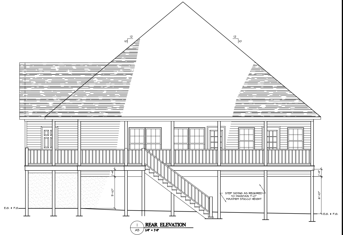
1 REAR ELEVATION A5 1/4" = 1'-0"