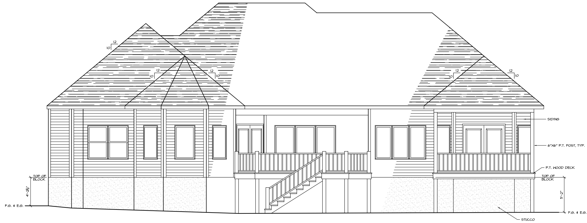
1 REAR ELEVATION A5 1/4" = 1'-0"