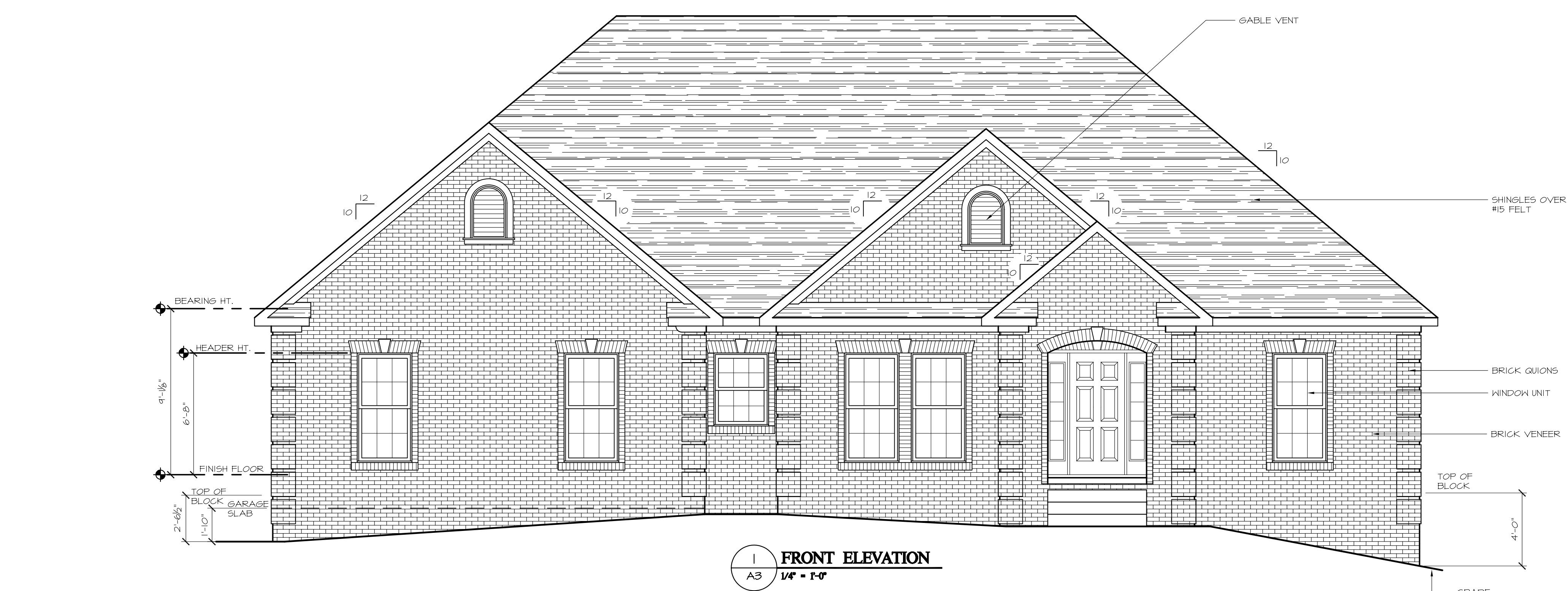
1 FRONT ELEVATION A3 1/4" = 1'-0"